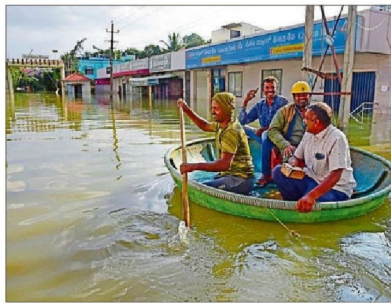
Coracles were pressed into service after a residential layout was inundated following heavy rains in Bengaluru recently.

The bench directed executive engineer of BBMP (Bommanahalli Division) to remain present on the next date of hearing for non-com-