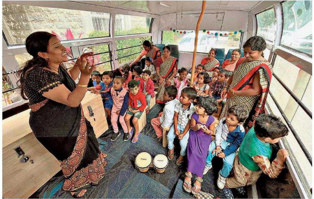
A 'Wonder on Wheels' vehicle that was launched at the BBMP office in Bengaluru on Monday.

"Architects have remodelled the bus with a detachable amphitheatre and musical areas, among others. The bus is furnished with detachable seating, shelves and storage to allow for free creative movement. Art, craft, musical instruments, library books and audio-visual systems, and