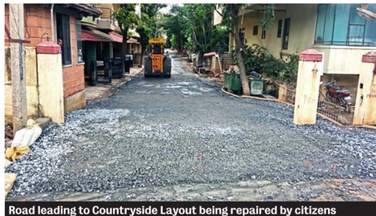
Road leading to Countryside Layout being repaired by citizens

Around 30 four-wheelers were damaged beyond repair due to waterlogging in the layout. "All the four-wheelers that were inundated