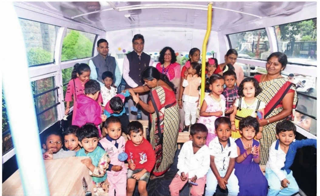
Children from anganwadi centres pose for a photo on Day One of the initiative being rolled out

"We will provide a teacher trained in the Montessori method and volunteers to train children in art and craft. We will also ensure training for the teachers provided by the BBMP. We have already launched two Wonder on Wheels on our own. Wonder on