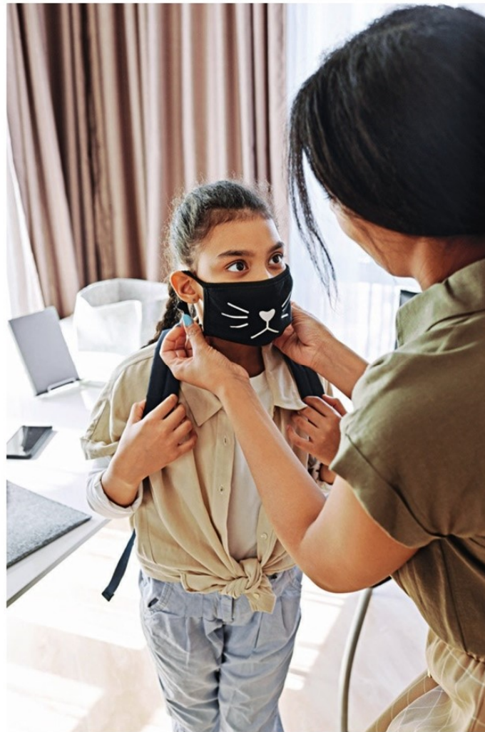
Since schools reopened, parents say kids are falling ill repeatedly

Fortunately, most children who have repeated infections don't have