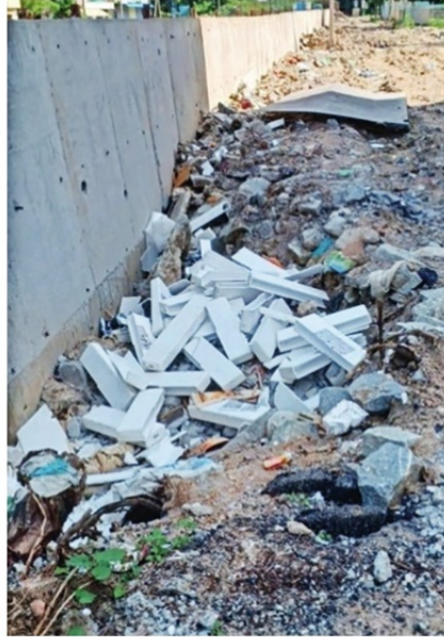
The service road in HBR layout is in shambles due to incomplete SWD work