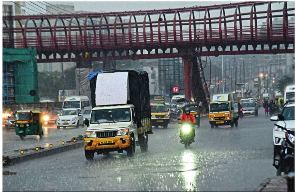
A stretch on the Outer Ring Road during a heavy downpour which brought life to a standstill in B'loru

Many cite the earlier instances when in August 2016, the Siddaramaiah Government had taken up a demolition drive when 141 houses