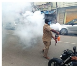
Fogging is important to keep vector-borne diseases at bay

Several camps were put up close to the slum areas to check upon the people's health. The doctors in the camps kept monitoring the health of the individuals. "The cases of diarrhoea can sporadically increase after a sudden disaster, including other water borne diseases. Hence we decided to deploy a team and check on the peo-