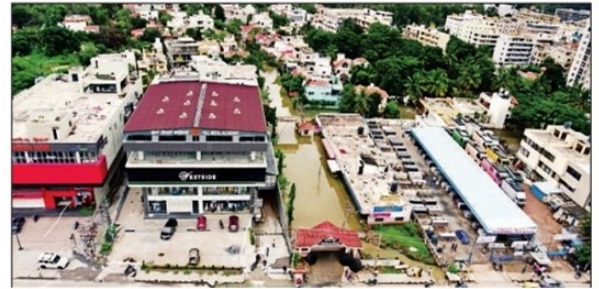
FLOODING ZONE: Rainbow Drive Layout on Sarjapur Road, spread over 35 acres, witnessed four instances of flooding in the last five months

In the last five months alone, the layout spread over 35 acres has witnessed four instances of flooding, forcing residents to employ tractors and boats to commute. In 2014, the then KR Puram tahsildar had ordered the demolition of nearly 40 houses sitting on two stormwater drains (SWDs) that scythe through this layout — one leading to Halanayakanahalli Lake and