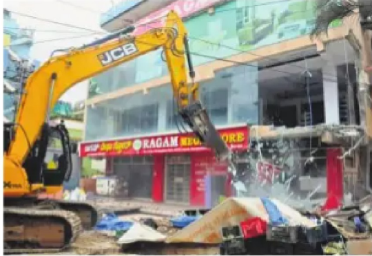
A bulldozer razes the encroached part of a building as part of BBMP's demolition drive at AECS layout in Bengaluru on Monday

Express anger, allege nexus between babus, netas for encroachment of drains, illegal layouts that caused floods