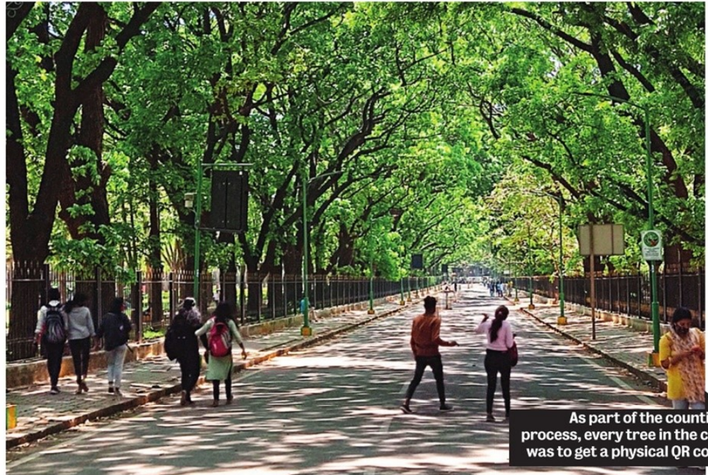
As part of the counting process, every tree in the city was to get a physical QR code

"The varsity had submitted a proposal a few months ago but we have decided to not sign the MoU. They had quoted a Rs 5.5 crore proposal and we thought we need not spend so much money on the census. BBMP will be doing it with inputs from the tree authority. There will not be signing any MoU with any organization for the census. However, we will surely take their support in terms of resources and ideas," said a senior official from the forest department.