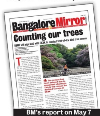
BM's report on May 7

Once the pilot is completed, the census is expected to take six months to complete.