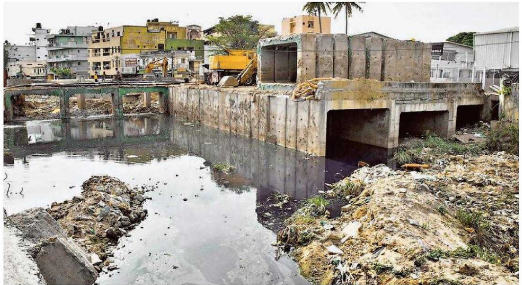
The High Court Bench has directed the BBMP to take steps to ensure prevention of dumping of all kinds of waste and other pollutants into storm-water drains.