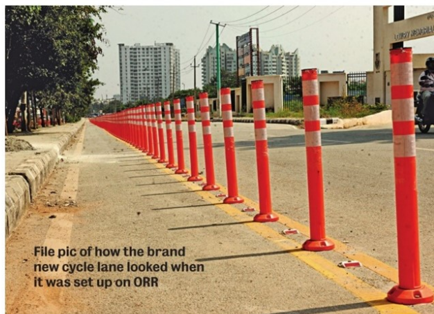
File pic of how the brand new cycle lane looked when it was set up on ORR

“ We had discussed the removal of BPL bollards after several complaints from motorists. But, the cycle lanes and bollards are being removed without our knowledge