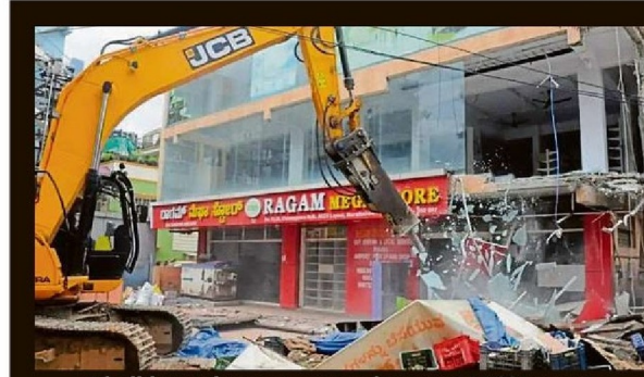
A bulldozer clears an encroachment at AECS Layout.

Municipal authorities, accused of going soft on the rich and powerful, have started clearing encroachments in a big way after Chief Minister Basavaraj Bommai ordered a crackdown on the root cause of the floods. Experts say silt accumulation and drain en-