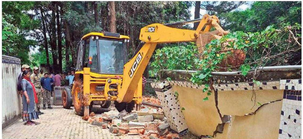
BBMP has started an anti-encroachment drive to remove illegal structures that have come up on storm-water drains in several areas of Mahadevapura zone of Bengaluru.

A senior BBMP official confirmed to The Hindu that these properties on different survey numbers have encroached upon the SWD. "A notice has been issued to these builders and soon we